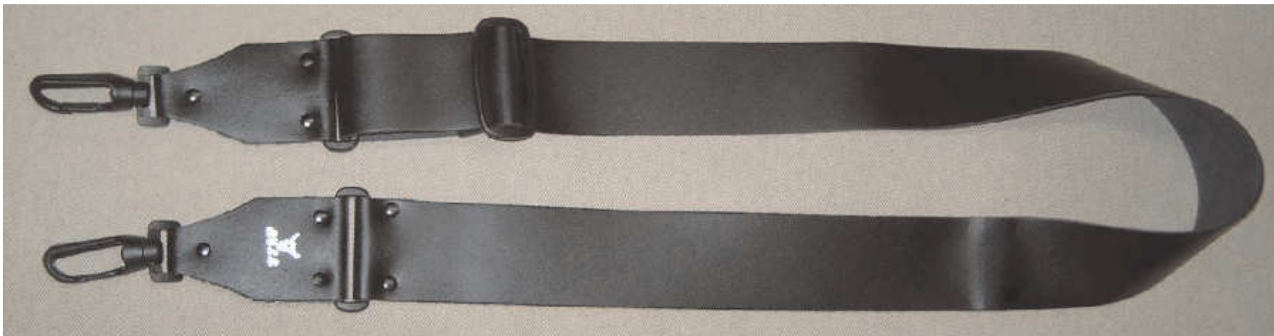
5,0 cm bull standard leather with 2 plastic hooks